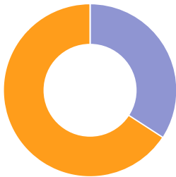
Gender of Group

On average in 2023, 5 or more Care-experienced young people consistently attend a CiCC meeting.